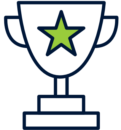
ISG Star of Excellence

Here is the email address: star@cx.isg-one.com